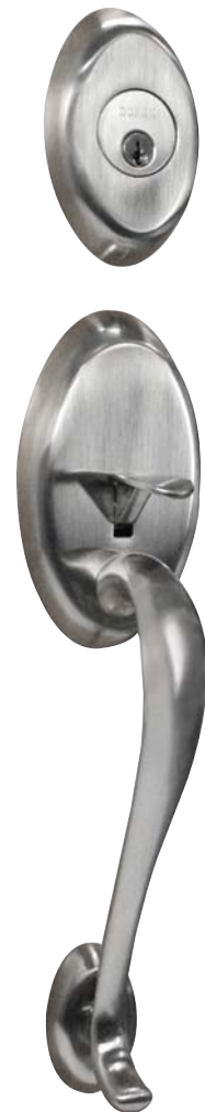
SUFFOLK Satin Nickel