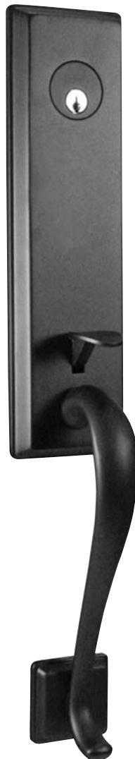
HOLBROOK Matte Black