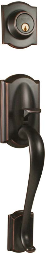
CARRAWAY Antique Bronze

Solid brass exterior trim • For 1 3/4" (44mm) to 2" (51mm) door thickness; 2 1/4" (57mm) kit available • Backset adjustable for 2 3/8" (60mm) and 2 3/4" (70mm) • Galvanized steel, brass and zinc die-cast interior mechanism • 5-pin rekeyable solid brass cylinder • Brass deadbolt with steel rolling pin insert and full 1" (25mm) throw • 5 1/2" (140mm) centre to centre hole spacing • Weiser keyway • Easy installation with template