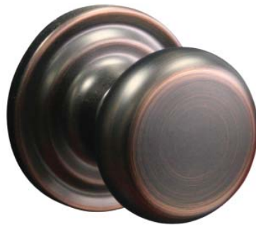
MONTAUK Antique Bronze

For 1 3/4" (44mm) to 2" (51mm) door thickness • Concealed mounting screws • Backset adjustable for 2 3/8" (60mm) and 2 3/4" (70mm) • Galvanized steel, brass and zinc die-cast interior mechanism • 5-pin rekeyable solid brass cylinder • Brass deadbolt with steel rolling pin insert and full 1" (25mm) throw • Weiser keyway • Easy installation with template